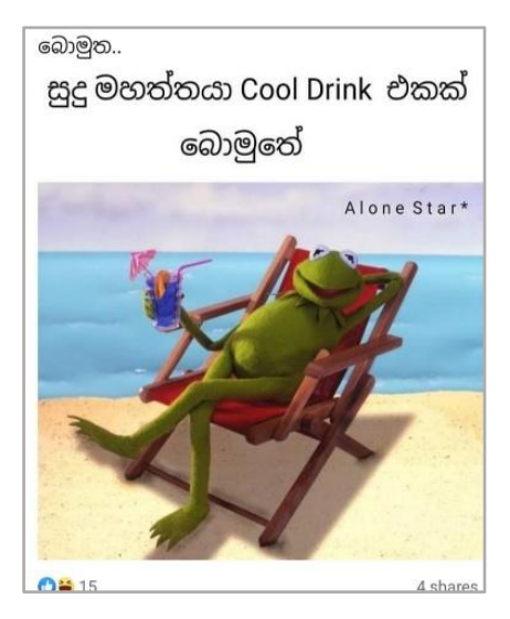
Figure 5. Different forms of spellings