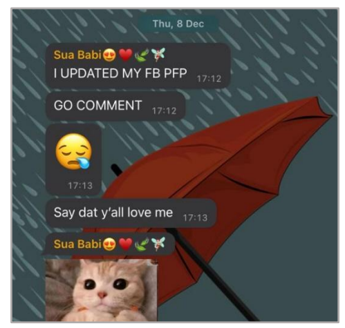
Figure 4. Different forms of capitalization

Using different patterns of capitalization was another phonological variation which maintains authentic oral presentation of the written language on social media posts and comments. For instance, all letters in capital form are used to stress the message by adding prosodic features, or to indicate verbal authenticities of shouting, blaming or arguing (Zappavigna, 2012; Lamontagne & McCulloch, 2017). This feature was not very popular in the Sri Lankan context and only a few samples were identified in FB (3) and WhatsApp (7) under the girl-girl conversation category. Some of them were, I UPDATE MY FB PFP, JANUARY20 (Figure 4).