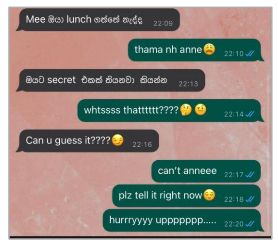
Figure 3. A sample of a prolonged vowels and consonants

Poets and novelists frequently use prolonged vowels as a linguistic tool to enhance the euphony in their literary creations, as prolonged vowels give an artistic sense to maintain the rhythm of such work. SNSs users tend to form words with prolonged vowels and consonants to give specific prosodic features in different spoken forms of the language. Thus, creative phonological forms, which we frequently see in interactive digital writing, may be interpreted as 'licensed misrule', that allow us to engage in 'linguistic clownery' (Bakhtin, 1984; Sebba, 2007). Consequently, these prolonged vowels and consonants help to maintain intonations and tones by adding a different pace and rhythm to the written forms of language in social media. The participants in these platforms aim to add prosodic features in written forms of language to maintain the means of speaking utterances in digital communications. Prolonged vowels and consonants were specifically used in the data samples collected from girls' conversation category in WhatsApp. According to sociolinguistics, females maintain their own styles in conversations because gender difference is a prevailing quality of language use. Prolonged consonants and vowels have been used as a specific characteristic to emphasize. To put it more simply, these features are used to elaborate a certain compassionate, and sentimental nature in their communications (Figure 3).