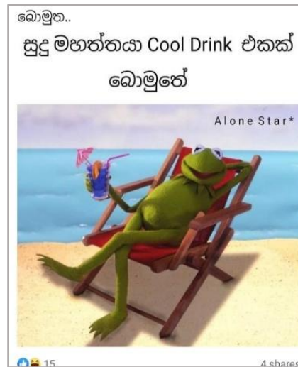
Figure 5. Different forms of spellings