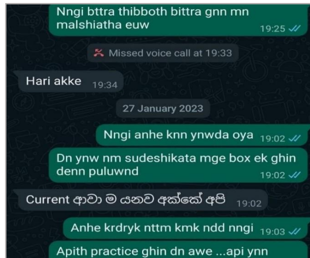
Figure 2. A Sample for words without vowels