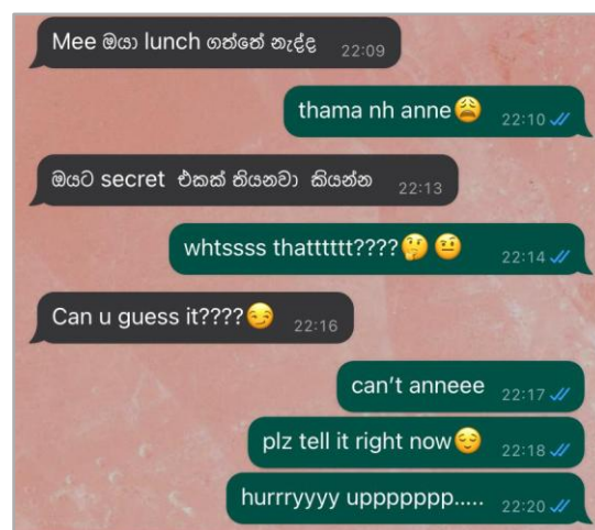
Figure 3. A sample of a prolonged vowels and consonants

Poets and novelists frequently use prolonged vowels as a linguistic tool to enhance the euphony in their literary creations, as prolonged vowels give an artistic sense to maintain the rhythm of such work. SNSs users tend to form words with prolonged vowels and consonants to give specific prosodic features in different spoken forms of the language. Thus, creative phonological forms, which we frequently see in interactive digital writing, may be interpreted as 'licensed misrule', that allow us to engage in 'linguistic clownery' (Bakhtin, 1984; Sebba, 2007). Consequently, these prolonged vowels and consonants help to maintain intonations and tones by adding a different pace and rhythm to the written forms of language in social media. The participants in these platforms aim to add prosodic features in written forms of language to maintain the means of speaking utterances in digital communications. Prolonged vowels and consonants were specifically used in the data samples collected from girls' conversation category in WhatsApp. According to sociolinguistics, females maintain their own styles in conversations because gender difference is a prevailing quality of language use. Prolonged consonants and vowels have been used as a specific characteristic to emphasize. To put it more simply, these features are used to elaborate a certain compassionate, and sentimental nature in their communications (Figure 3).