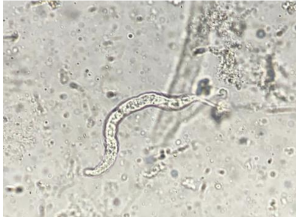
Figure 1: Presence of the larval stage of a filarial parasite in the dissected thorax region of a Mansonia mosquito under 100x magnification.

was Ma. uniformis . The larval stage of filarial worm identified from a dissected mosquito is illustrated in Figure 1.