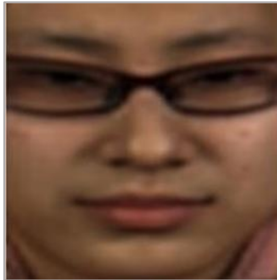
Figure 3. Super resolution image output