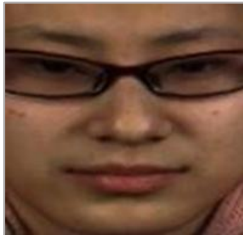
Figure 2. Low-resolution image output